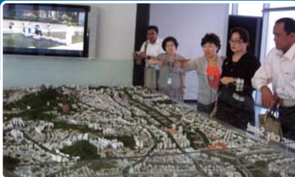
Experts from Seoul sharing sustainable transportation systems with transport task force delegates from Palembang, July 2009.

Cover photo: C2C Cooperation between Yokohama and Hanoi on water supply.