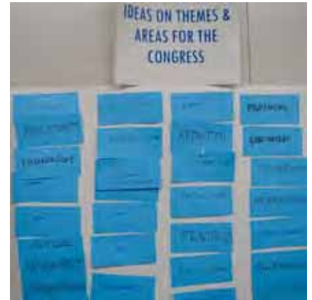
Brainstorming Session in Yokohama, November 2012

Welcome to the CITYNET 2012 Annual Report. This year marks the 25 th Anniversary of CITYNET's founding and a quarter century of connecting cities across the Asia Pacific.