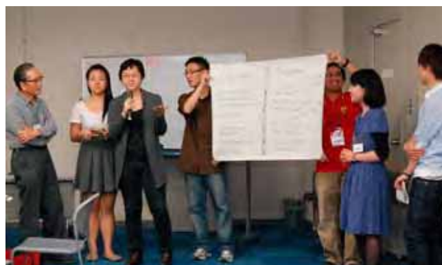
CYJ Members and Students from NUS work together, Yokohama, Japan, May 2012.

Throughout 2012, CYJ advanced its mission to grow and connect with youth globally through training programmes, educational exchange and more.