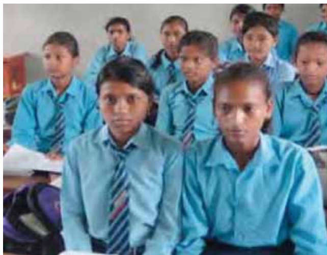
Students in Ramgram Municipality, 2012

CITYNET Nepal National Chapter completed the first school sanitation project in 2010 in Tansen Municipality. This project consisted of building a clean and accessible school restroom, increasing sanitation and comfort for the students and teachers. Many nearby municipalities and members of the Municipal Association of Nepal (MuAN) expressed interest in replicating this project.