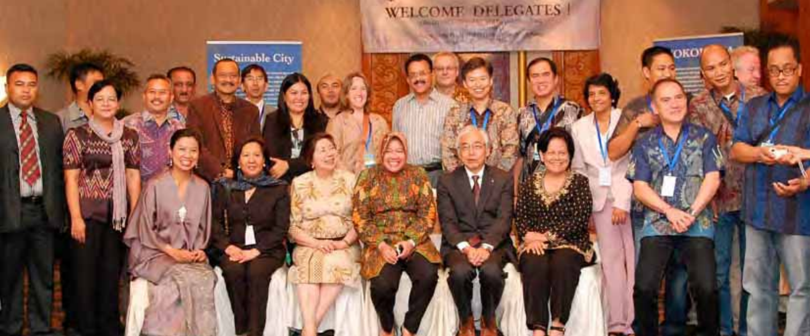
Executive Committee Members and the Participants at the 25 th Anniversary in Surabaya, Indonesia, July 2012.