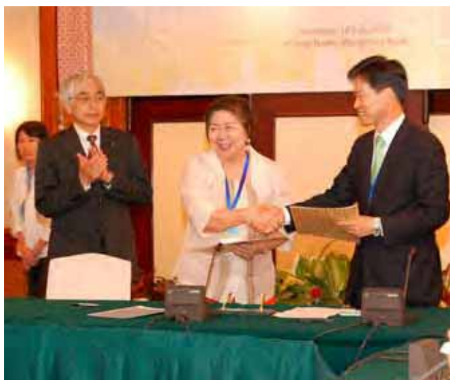
CITYNET and KOTI Officials at MOU Signing, 2012

The Executive Committee also approved the 2013 plans, budget, and new members of CITYNET. CITYNET and KOTI signed an MOU on pursuing sustainable transport across Asia-Pacific region with the focus on training and capacity building programmes.