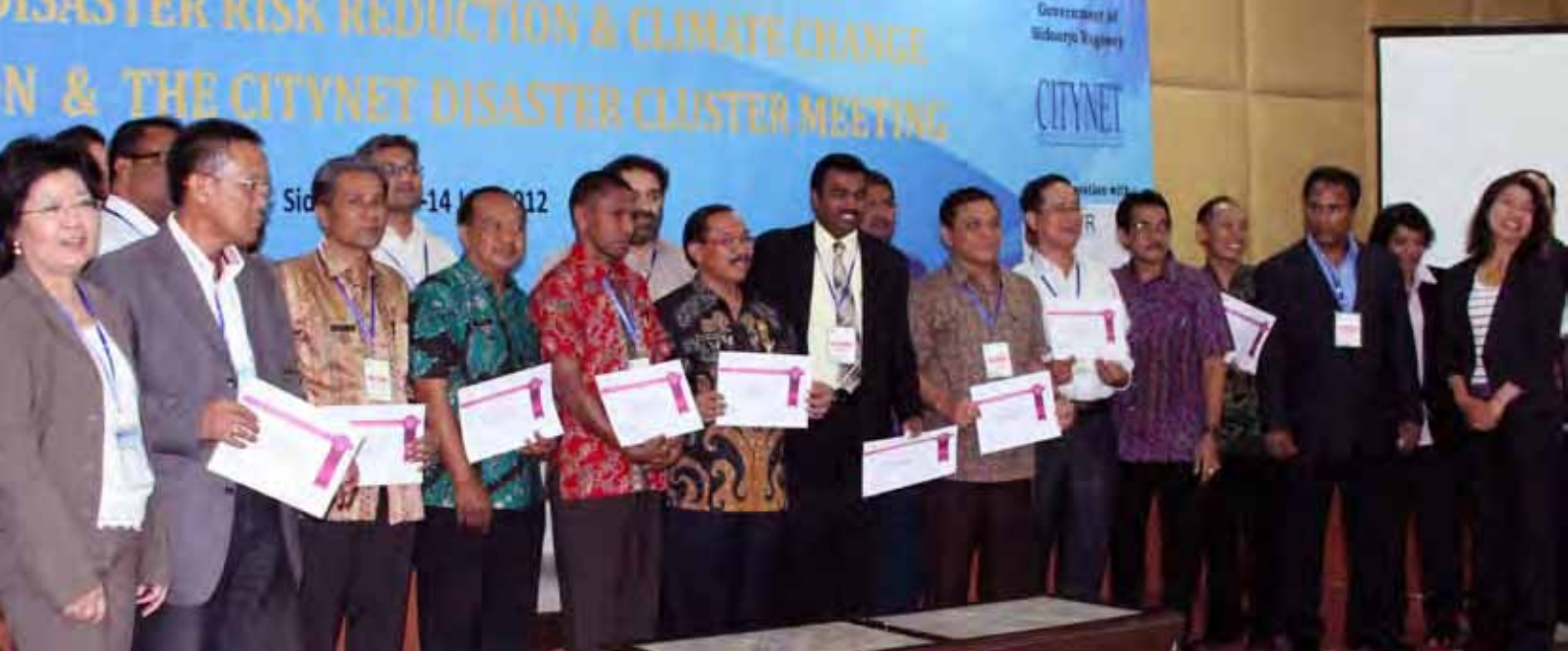
Local governments are making commitment in the Making Cities Disaster Resilient Campaign, Sidoarjo, July 2012