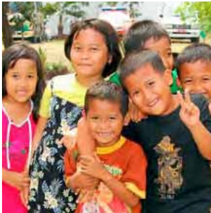
Children in Surabaya, Indonesia, July 2012