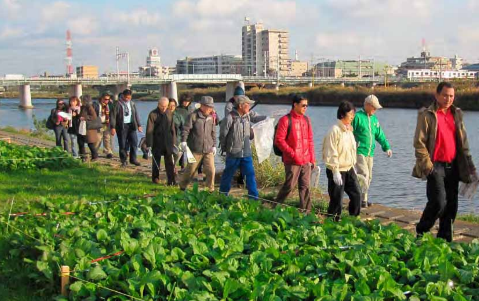
CBARAD Participants Examine Biodiversity Preservation Along the Tsurumi River, November 2012