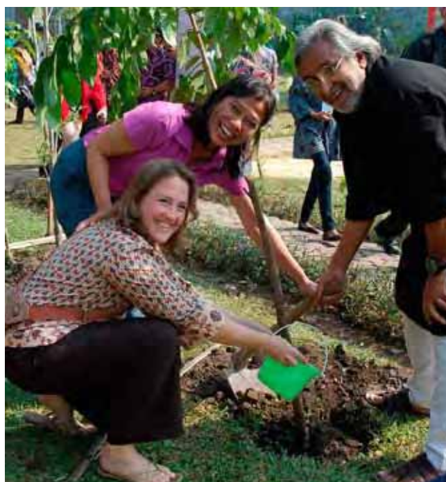
Tree planting ceremony in Surabaya, July 2012.