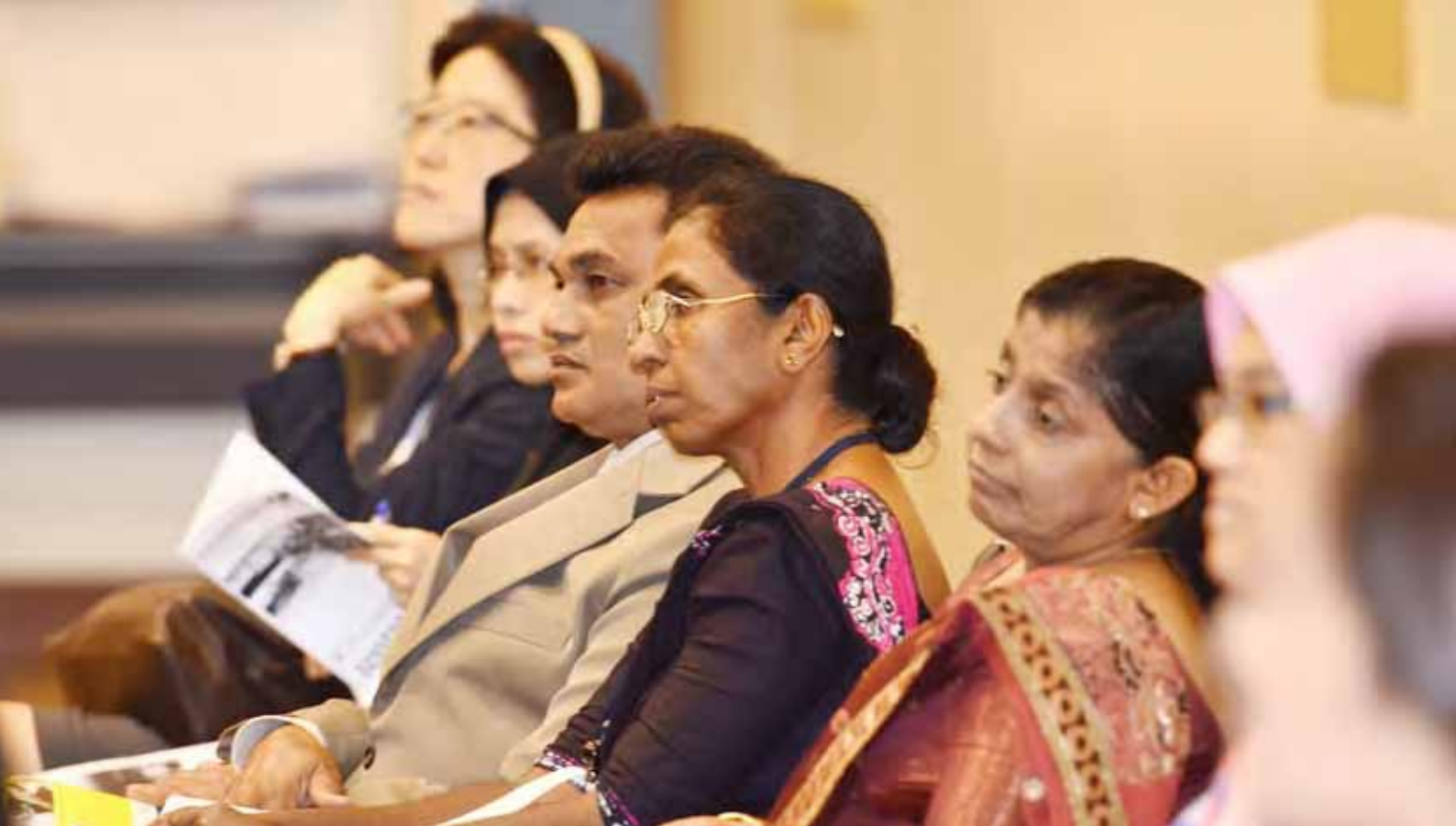
KLRTC 25 Participants in December, 2012