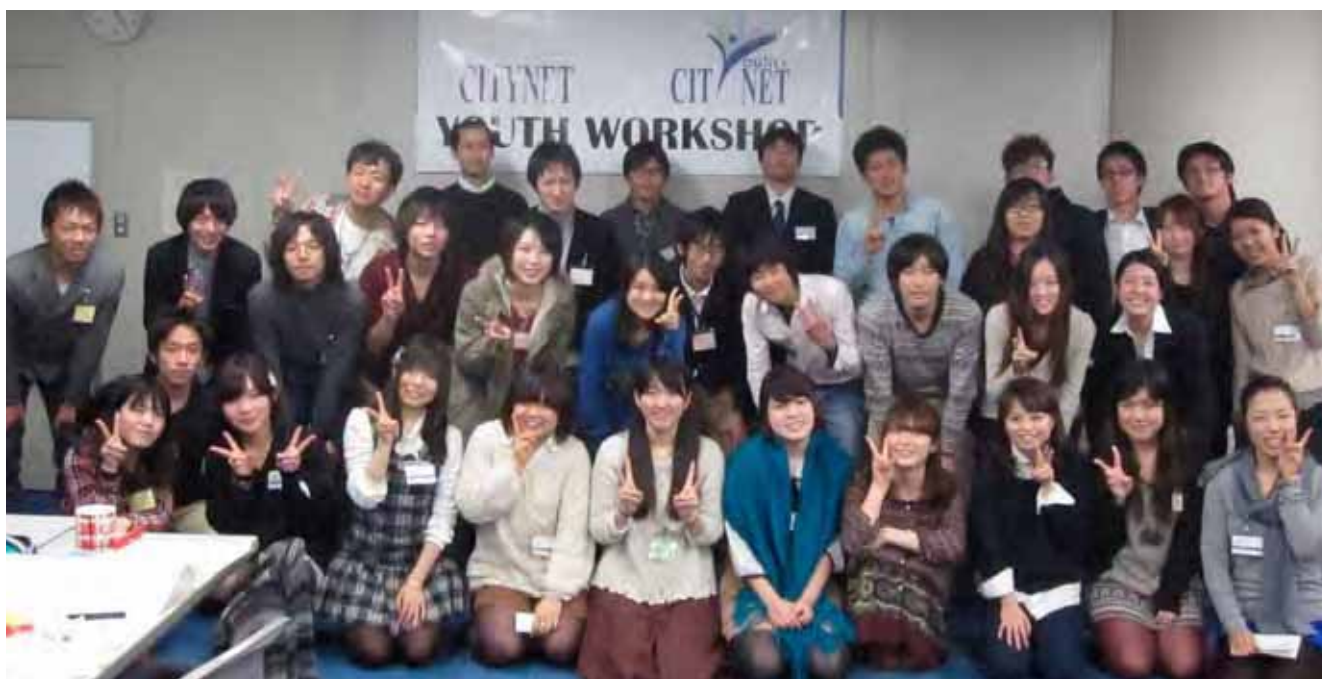
CYJ Participants Youth Workshop, Yokohama, Japan, May 2012