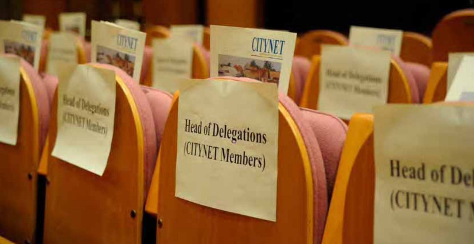
Hamagin Hall, Yokohama, in preparation for the Commemorative Seminar on Oct. 31 st , 2012.