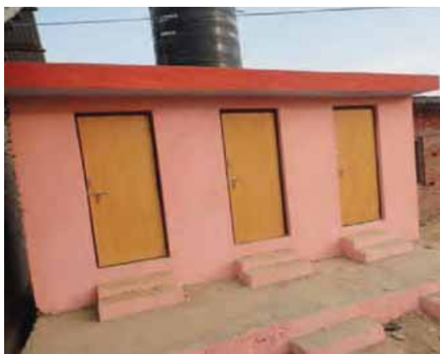
New Sanitation Facilities at the Secondary School in Ramgram Municipality, 2012

In 2012, Ramgram Municipality submitted a school sanitation project proposal to CITYNET. Ramgram Municipality has a significant lack of physical infrastructure, from roads to sanitation and sewage facilities. To help develop the area, Ramgram proposed a project to construct a gender-friendly toilet in a government school to both improve sanitation conditions and raise awareness of the importance of hygiene and cleanliness.