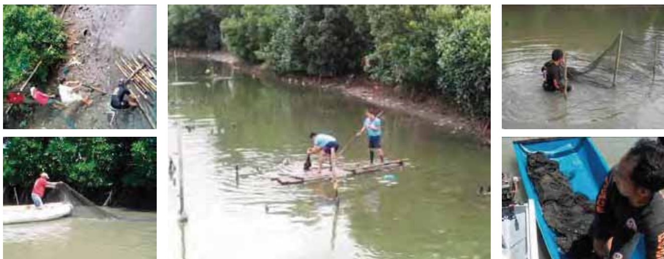
Features of the Iloilo River Climate Change Adaptation and Alternative Livelihood Project activities.

companies participating in the Smart Cities conference. The representatives also participated in the seminar on Disaster Risk Reduction organised as a part of the CITYNET 25 th Anniversary celebrations in Yokohama.