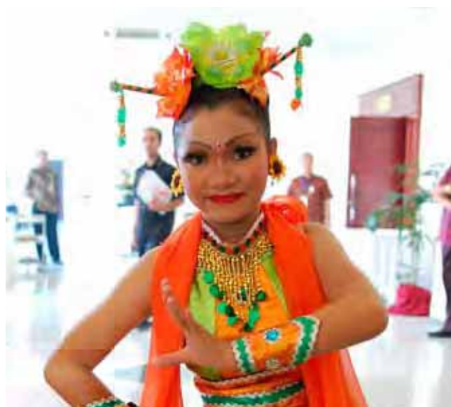
A welcoming dancer from the Sidoarjo Disaster Seminar, July 2012