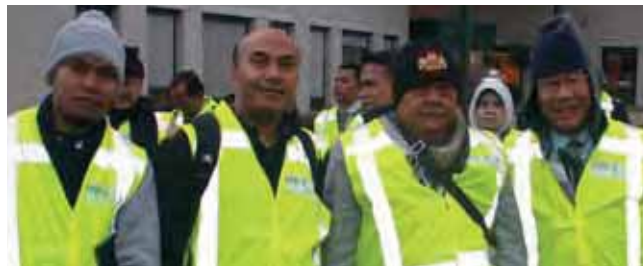
Indonesia National Chapter Members visiting the Netherlands, 2012

CITYNET Indonesia has planned a strong agenda for 2013, including several seminars on governance and infrastructure, an International Study Visit, and a newsletter to keep CITYNET Indonesia members informed of updates and events.