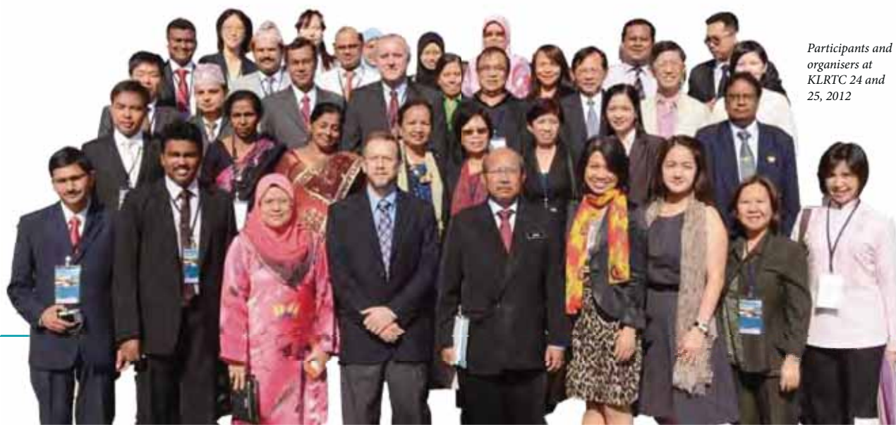
Participants and organisers at KLRTC 24 and 25, 2012