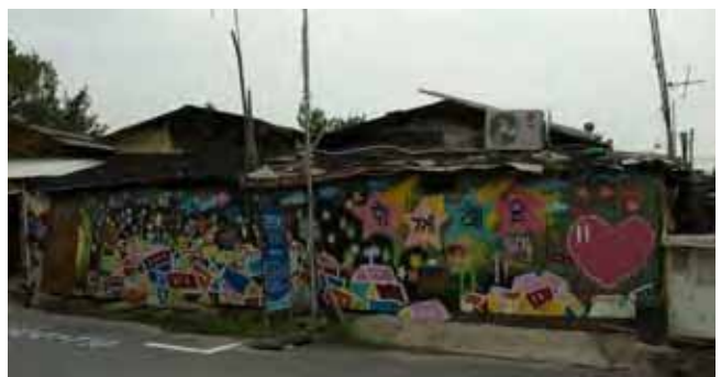
Informal Housing in Seoul, Korea, July, 2012

The July 2012 workshop was the first time local stakeholders were asked to participate in the dialogue on urban poverty, addressing concerns that previous talks had only included government officials and foreign experts. After the success of this workshop, SMG plans to establish a workshop series and standing committee for discussion and negotiation. Within 2 years, Seoul expects to have concrete proposals for reducing urban poverty by addressing informal housing.