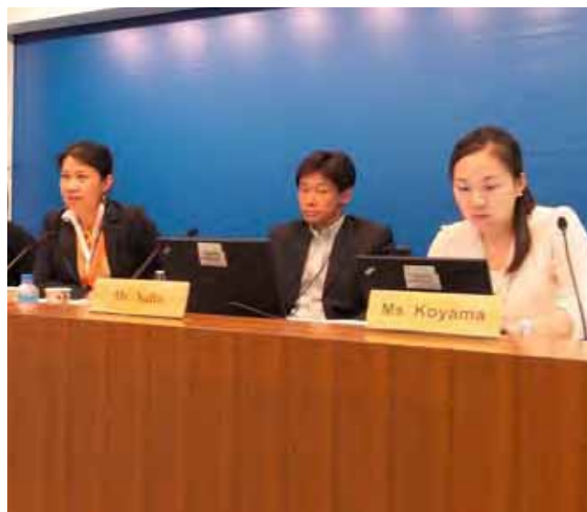
CDRI Video Organizers at TLDC in Tokyo, October 2012

Participants also visited the Sidoarjo mud flow, the largest mud volcano in the world. It began erupting in May 2006 and hasn't stopped since, displacing numerous communities. Sidoarjo has been working with international aid organisations since 2006 to rehabilitate these individuals.