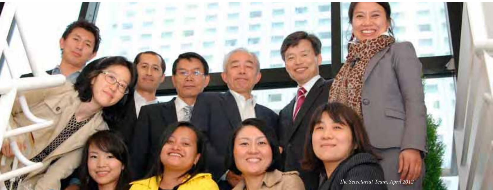
The Secretariat Team, April 2012

We look forward to seeing you all in November 2013.