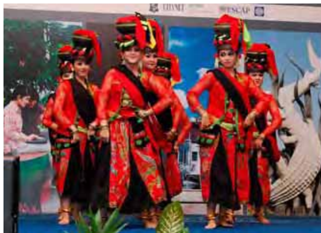
Traditional Indonesian Dancers

Member cities had a chance to discuss the practical and financial challenges of sustainable growth, and to exchange possible solutions for the future. With Surabaya as an excellent example, the benefits of green urbanisation were clear, giving participants a better idea of what all our cities could look like in the future.