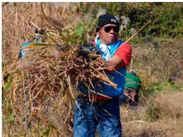
A CBARAD Participant takes part in Volunteer work near Yokohama, November 2012

Iloilo trainees visited disaster prevention facilities, interacted with Japanese communities and took part in disaster drills activities. They also drafted Community Based Disaster Resilience plans based on the unique needs and vulnerabilities of their own communities. This three-year project is a collaborative effort between CITYNET, the Japan International Cooperation Agency (JICA), and the City of Yokohama.