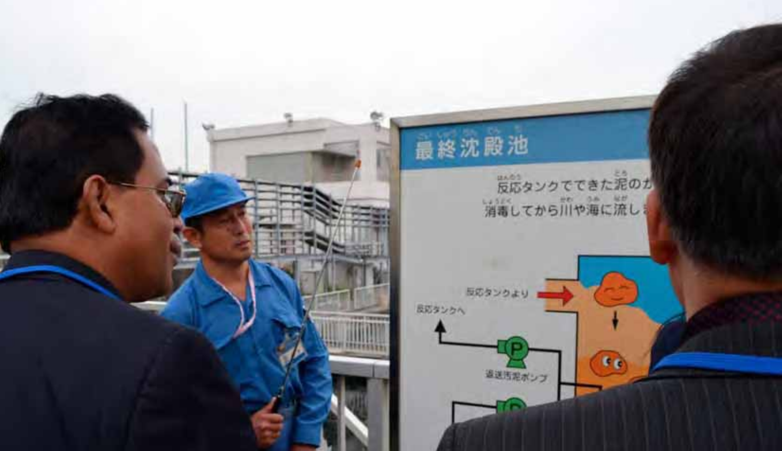
The Yokohama Smart Cities Project (YSCP) Participants in Yokohama, Nov. 2012