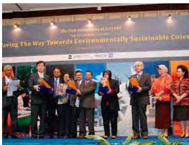
CITYNET Member Cities receiving C2C Awards in Surabaya, Indonesia, July 2012

CITYNET recognised four cities, Yokohama, Japan, Makati, the Philippines, Surabaya, Indonesia, and Seoul, South Korea for their exceptional work in C2C cooperation. They were awarded C2C Awards for Best Partner, Cooperation, Participation, and The Future of C2C, respectively. Medals were also given to CITYNET’s founding member cities to recognise their longstanding commitment and engagement with the mission of connecting local governments across the Asia Pacific.