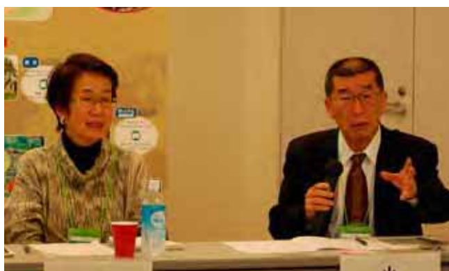
Participants at the 16 th Japan Forum in Yokohama, Japan

In their presentations, both evaluators had suggestions for the Tohoku region based on their assessment of the Post-Tsunami Community Centre Project. These included allocating more space for women and children, and expanding community-based activities, counselling services, and livelihood training programmes. Other evidence suggested the importance of building trust between communities and municipalities.