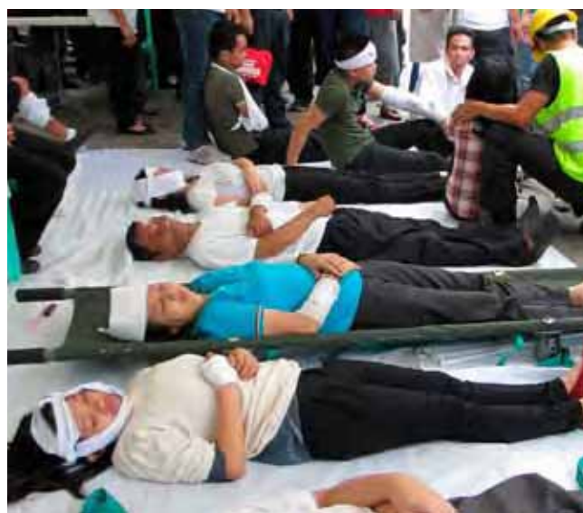
A disaster training programme in Makati, Philippines