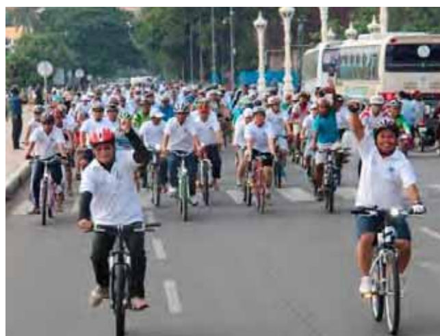
Bikers race through the streets of Phnom Penh

Phnom Penh has gained much from CITYNET, including the environmental education project, solid waste reduction and various other capacity building programmes.