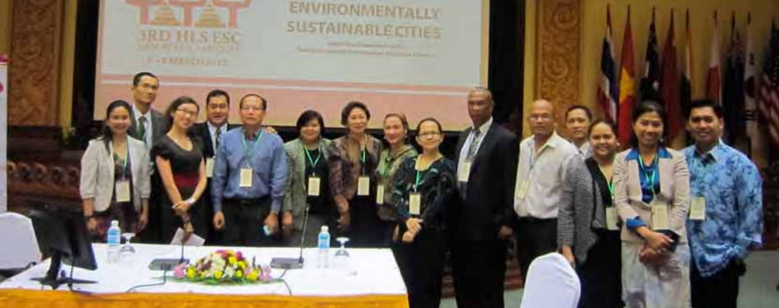
Participants at the Third Seminar on Environmentally Sustainable Cities, Siem Riep, Cambodia, in March 2012