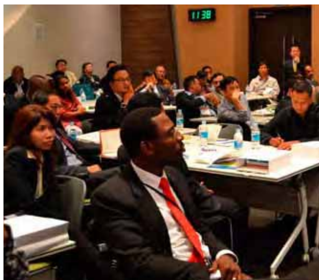
Participants in action at KOTI and CITYNET Workshop, 2012

The workshop provided an opportunity for local government