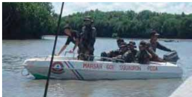
Iloilo workers removing illegal fishing nets, 2012

Financial assistance was provided to 72 affected individuals in June, 2012 by CITYNET and the office of Senator Franklin Drilon. Follow-up quarterly meetings with beneficiaries were conducted to provide technical assistance and support.