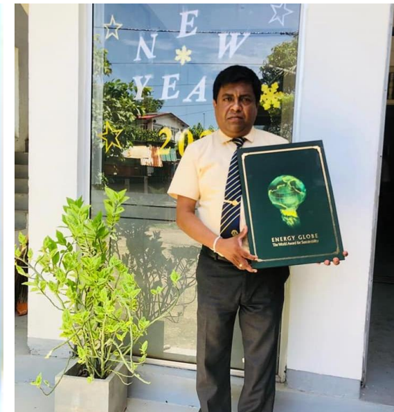
Energy Globe Award