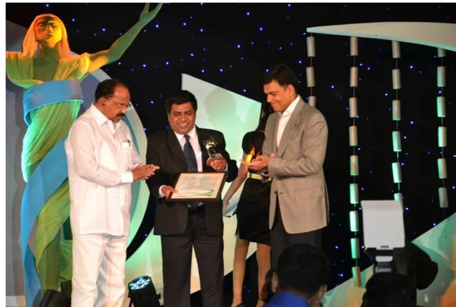
Earth Care Award