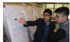
Makati, Philippines NHK

Disaster education products and materials