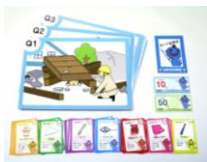
Plus Arts Original Disaster Education card games

Disaster education products and materials