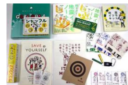
Plus Arts Original DRR Books and Goods