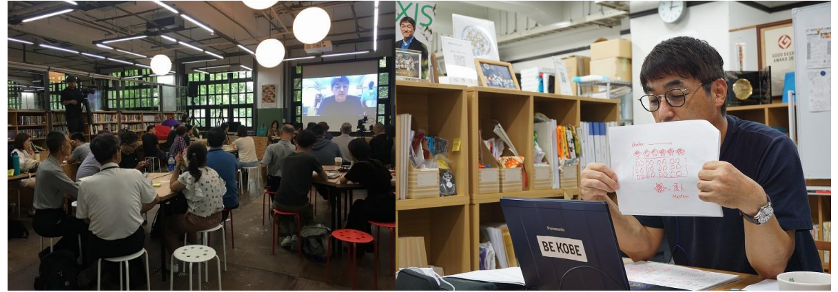
Taiwan Design Research Institute, Taipei, Taiwan