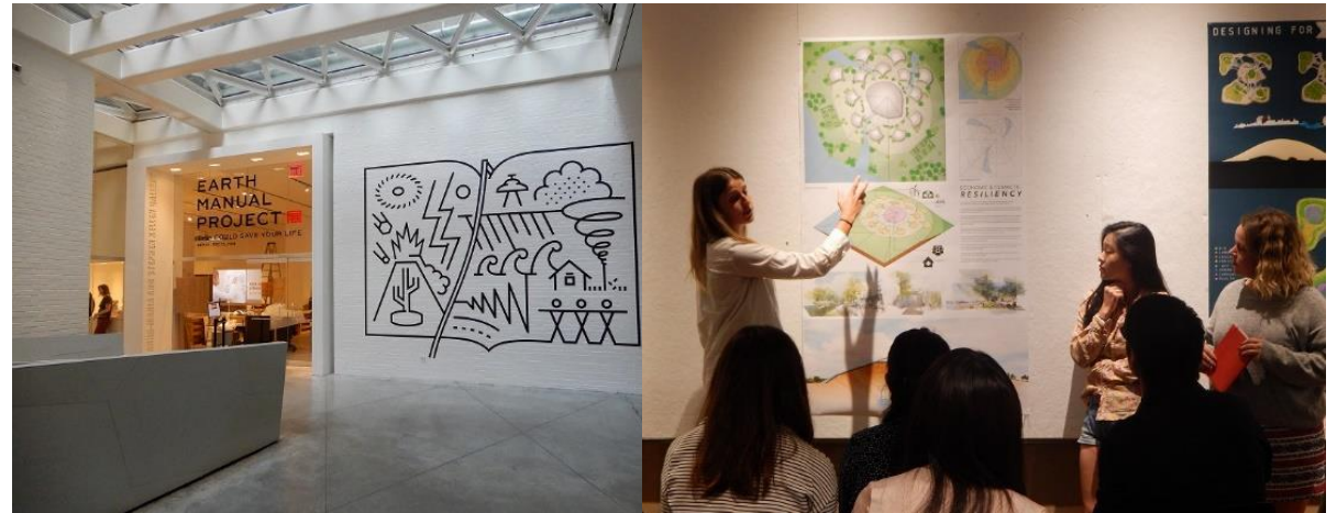
Parsons School of Design, New York, USA