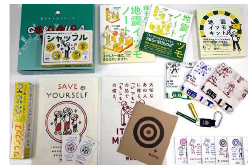
Plus Arts Original DRR Books and Goods