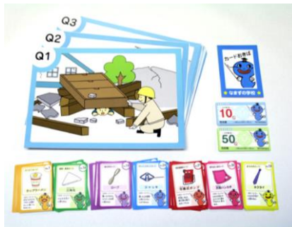
Plus Arts Original Disaster Education card games

Disaster education products and materials