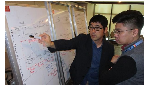
Makati, Philippines NHK

Disaster education products and materials