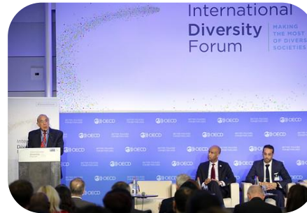
International e- forum