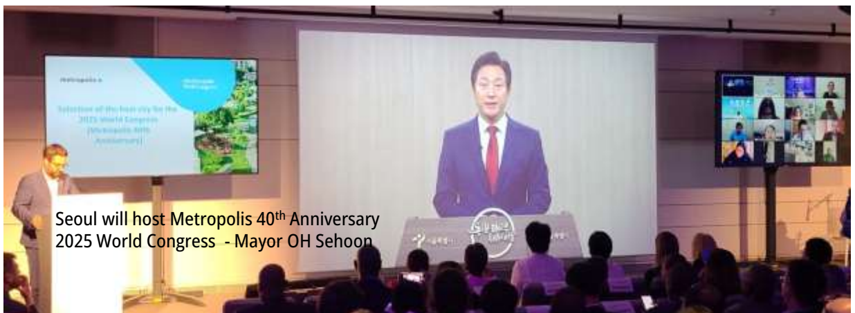
Seoul will host Metropolis 40 th Anniversary 2025 World Congress - Mayor OH Sehoon

In 2024, marking the 10th anniversary of the MITI headquarters, SHRDC plans to completely revamp our MITI training program. This involves adopting a cross-sectoral and multilateral approach to ensure its effectiveness. Most importantly, in 2024 and beyond, with the renewed MITI training programs, SHRDC aims to transform the rigid and perfunctory MITI network into a true embodiment of the idea of "a global network of local training institutes," as outlined in the 2024 -2026 Metropolis Strategic Action Plan.