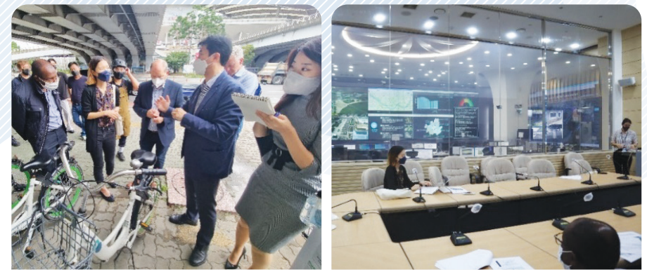
Final conference for the EU-funded ICP-AGIR in Inchoen

MOUs: Dublin-Seoul, Sofia-Sejong, Almeria-