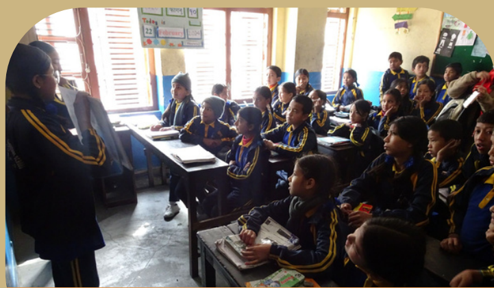
Senior students of the DRR Education Club engages in storytelling technique for raising awareness on disasters.