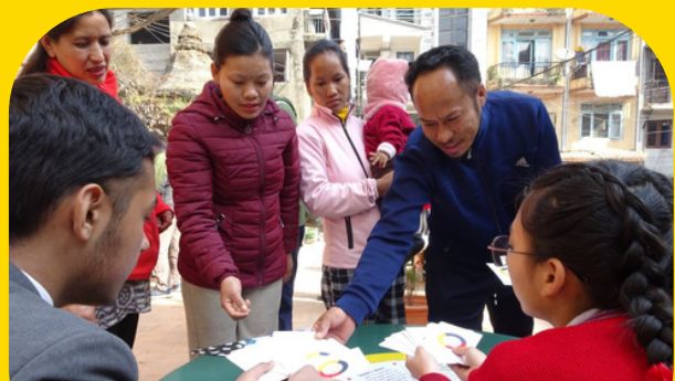
The members of the community were highly participatory and interested to learn about DRR.