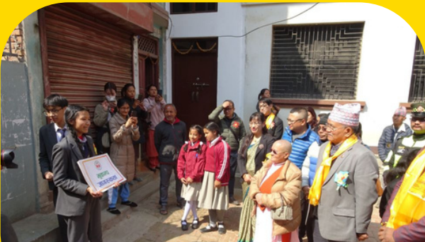
Students demonstrate DRR games to the mayor and the members of community.