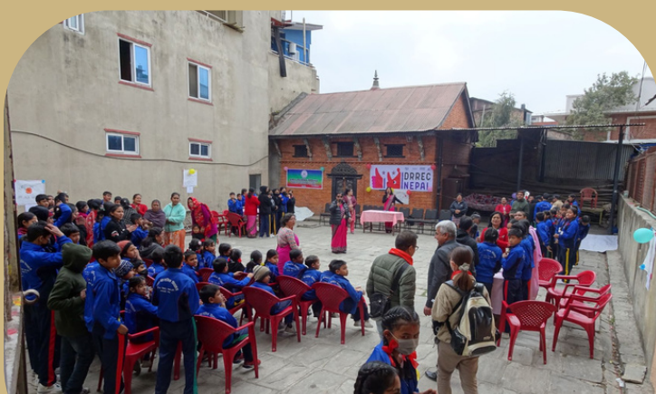
Prabhat Secondary School organizes a community event where DRR Education Club students facilitated various talks and interactive games on DRR.