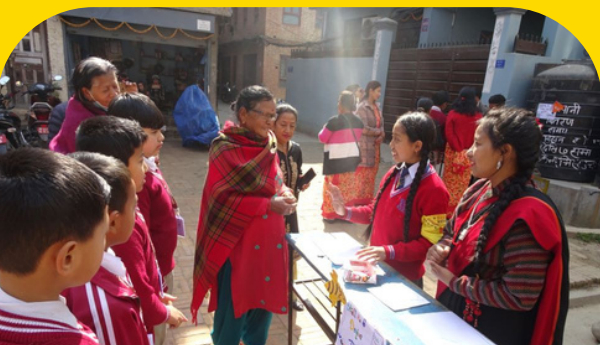
Students interact with community members in their local dialect to engage them in the activities.