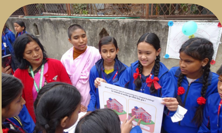
Senior students of the DRR Education Club explains the correct way of constructing buildings to make it more resilient against earthquakes.