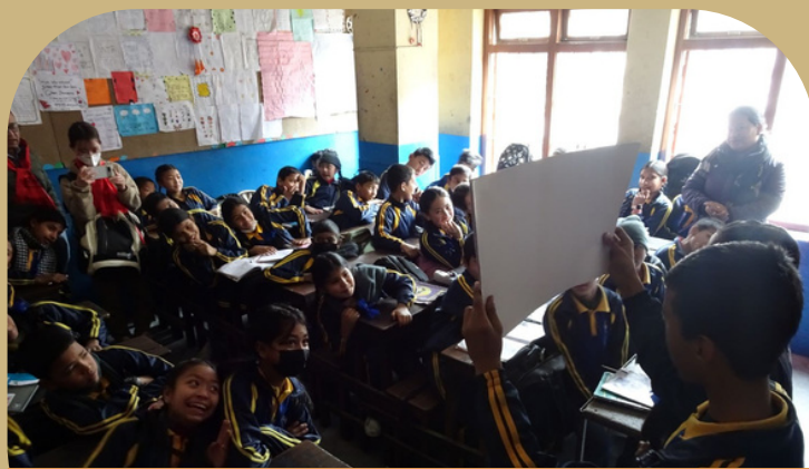
Students enjoy playing quiz games which are aimed at differentiating between right and wrong related to disasters.