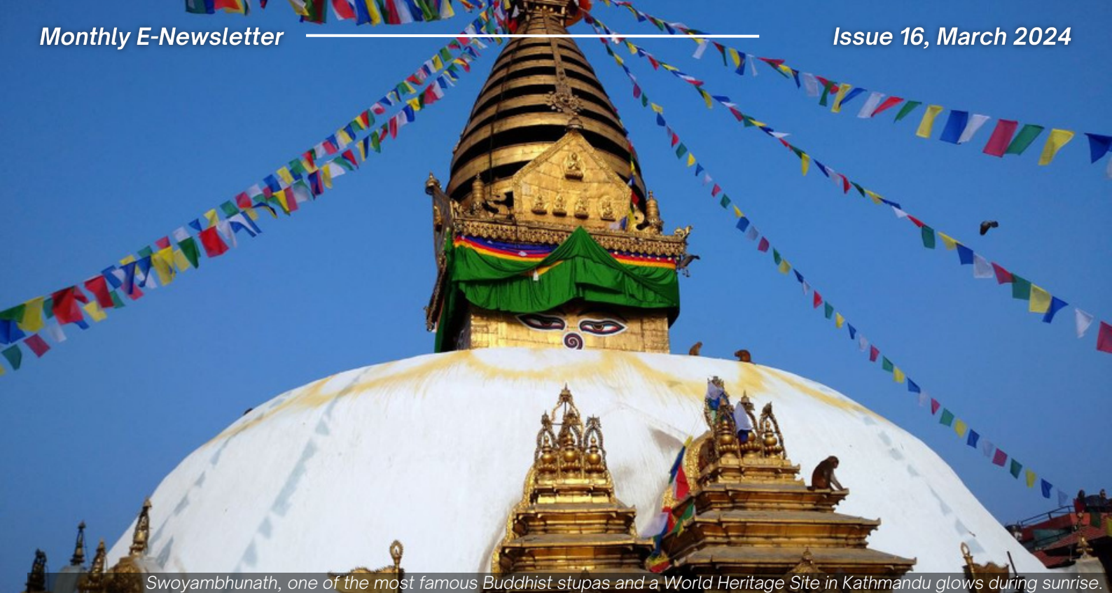
Swyambhunath, one of the most famous Buddhist stupas and a World Heritage Site in Kathmandu glows during sunrise.