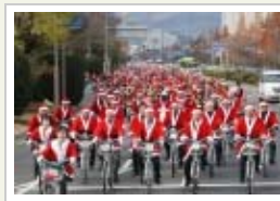
Santa bike ride with the Mayor of Changwon

A big welcome from the CITYNET Secretariat for the last edition of eNews for this year. So much has happened this year in the area of disaster, however, many countries in the Asia Pacific are working towards disaster prevention and risk reduction with the aim of building more resilient cities.