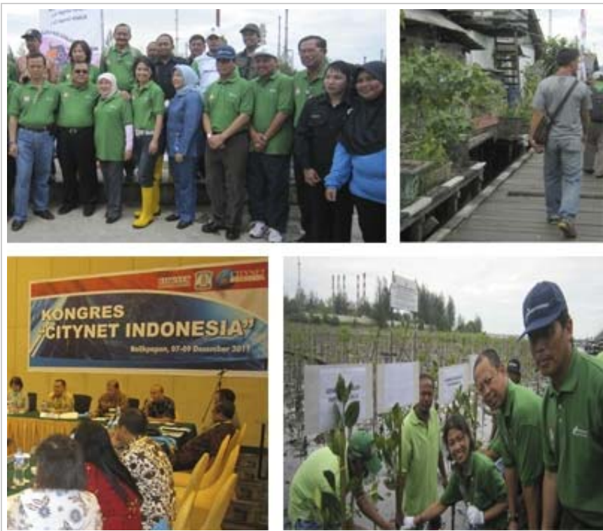
(top-left) Mayors and senior officials planted mangrove at the low-income settlement