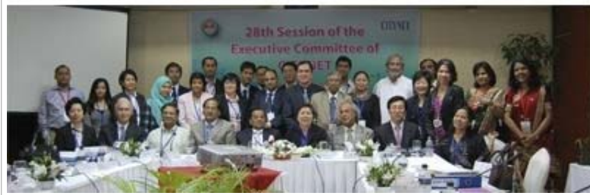
Group photo of delegates at the International Seminar on Climate Change and the Role of Local Government in Dhaka (top) and the 28th Executive Committee meeting (bottom)

CITYNET in collaboration with Dhaka City Corporation (DCC) recently hosted a Climate Change and the Role of Local Government International Seminar in Dhaka, Bangladesh, which was attended by mayors, senior city officials, research and civil society groups from 12 different countries. The seminar gave participants the opportunity to discuss how climate change is altering their cities and what practical steps local authorities can do about it.