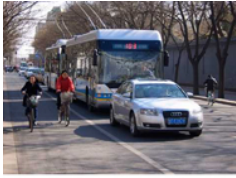
Financing Sustainable Urban Transport International Review of National Urban Transport Policies and Programmes

GIZ-SUTP in partnership with Ministry of Physical Infrastructure and Transport, Government of Nepal, UN-Habitat, ADB delivered a two-day training course in English on “Sustainable Urban Transport” on 28-29th October, 2013 in Kathmandu, Nepal. The objective of this two-day program was to enhance the capacity of local decision makers and urban and transportation planners to formulate and implement