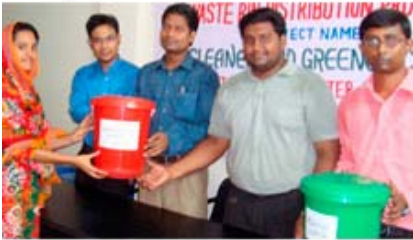
waste segregation bins