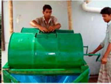
rotary composting bin