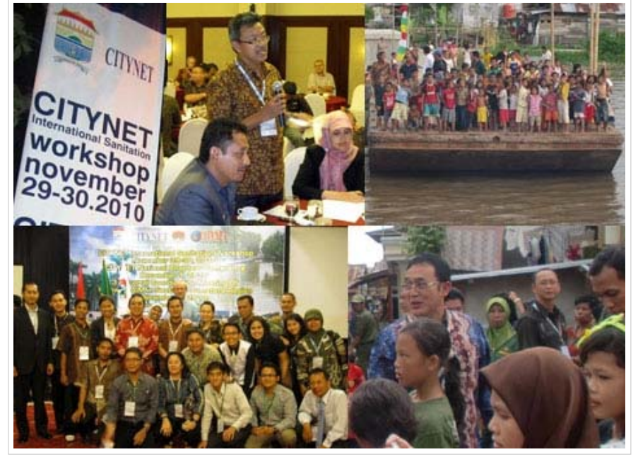
The city of Palembang, Indonesia hosted the CITYNET International Sanitation Seminar with over 250 participants from 11 countries which focused on solutions and practices specific to the Asia-Pacific region. The CITYNET National Chapters meeting directly followed the workshop.

Developing cities throughout the Asia-Pacific region are finding new and effective methods to combat the difficulties of sanitation provision. Yet, sanitation remains one of the most pressing issues in rapidly growing urban populations. Waste management, supportable access to safe drinking water, and lack of technological improvements in urban slums are just a small portion of the myriad of challenges local governments face in trying to develop environmentally sustainable cities.