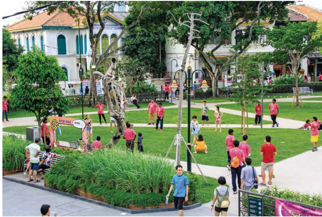
One of the very few open green spaces within the heritage zone of George Town