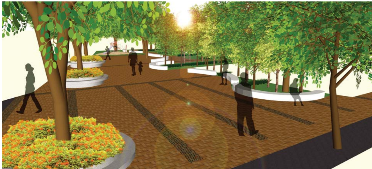
Artist impression of the initial proposed designs for the park which was eventually replaced with the current design

for the project to be implemented, it was important to relocate the traders, who had crowded out families and children, as the area was perceived to be unsafe.