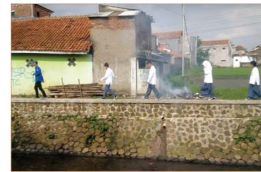
Water sampling for quality testing