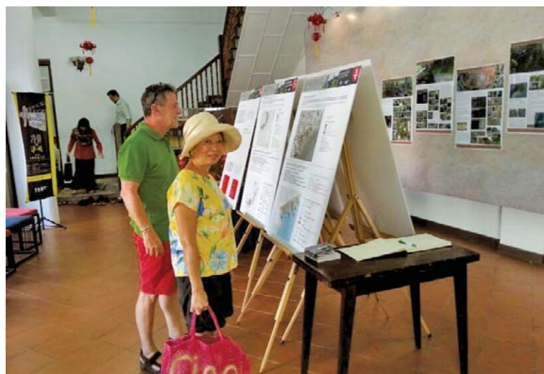
Proposed plans for the site were exhibited at the George Town World Heritage Incorporated for public input and feedback.

Community engagement was conducted throughout the project to keep a constant dialogue with