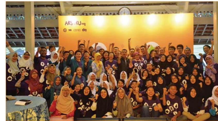
Participants present their ideas at Aksiku and DesignAction workshop.