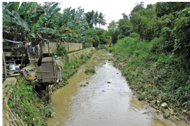
Before the normalization, the river border started to disappear partly due to the distress caused by the growing informal settlement.

AN ARTICLE BY: Kanafie, S.IP, MM Banjarbaru City Government Phone: +6281351060809/ +6285251417809 Email: fhie.bedjo@gmail.com