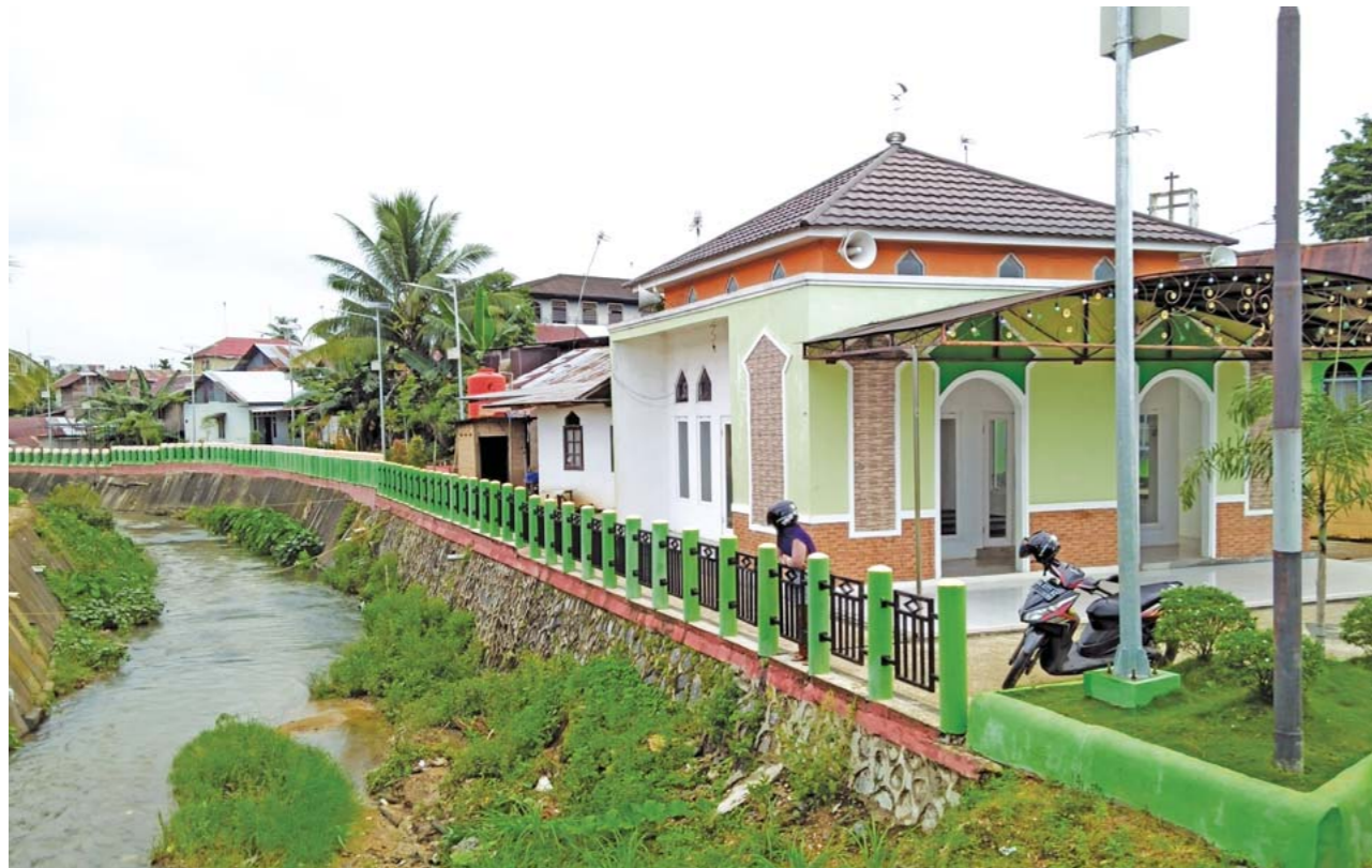
Kemuning River after the normalization project.

river. Another significant challenge was the city's limited financial resources, which means limiting government's initiative to provide compensation to residents who owned the certificate of occupancy and land use rights. They overcame this issue by using a gentle persuasive approach to educate residents about the importance of restoring the river function and how they could work together for public interest.