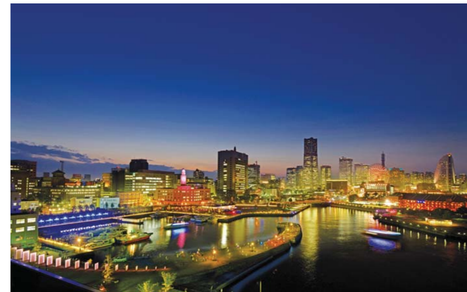
Zou-no-hana Park