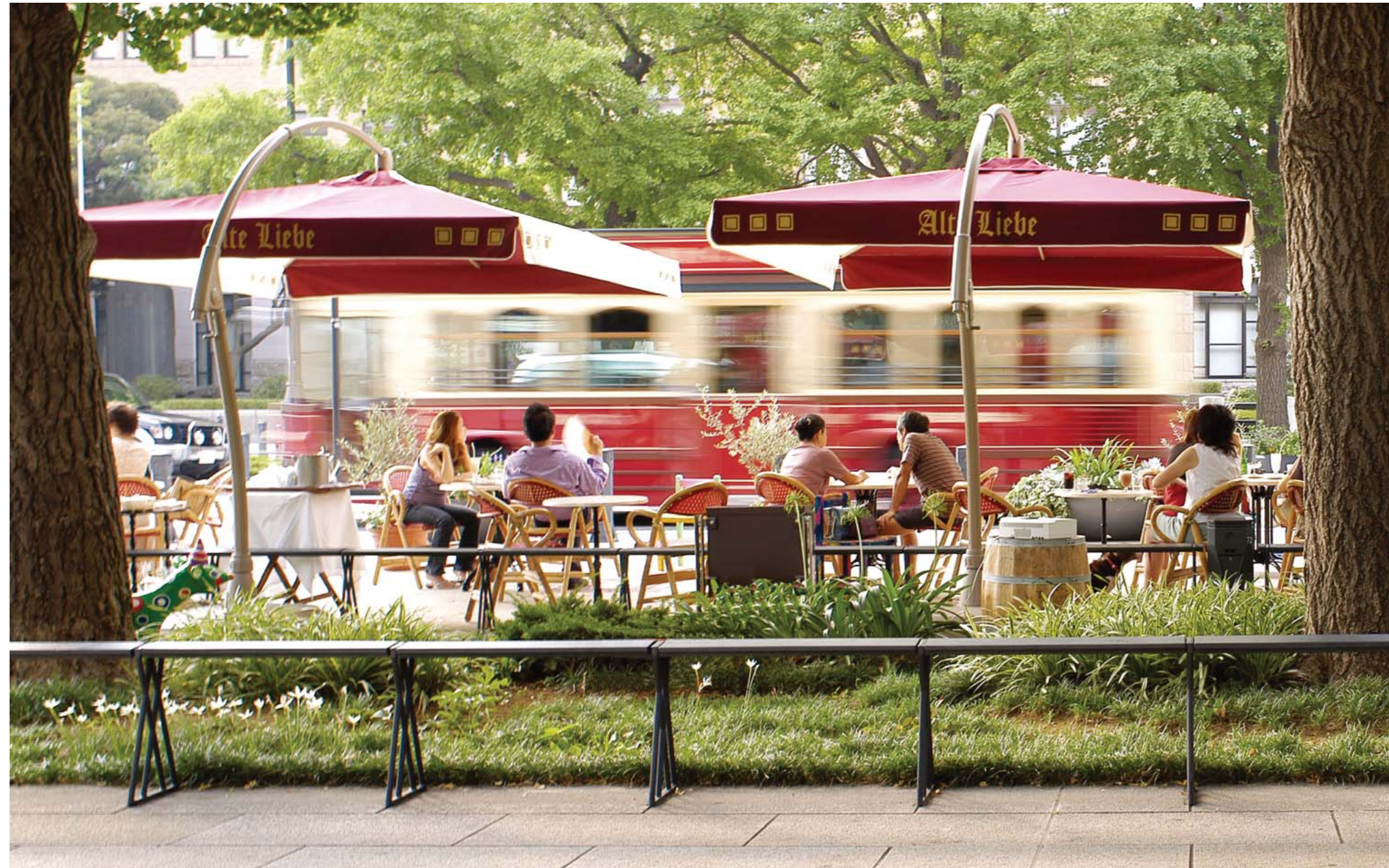
Sidewalk Cafés on Nihon Odori Street

□ The Yokohama Mayor Fumiko Hayashi shares Japan's second largest city's tacit knowledge and advanced experience in providing and developing public spaces. Coupled with a good design, one of the most recent innovations is their collaboration with the private sector in maintaining and using public spaces.