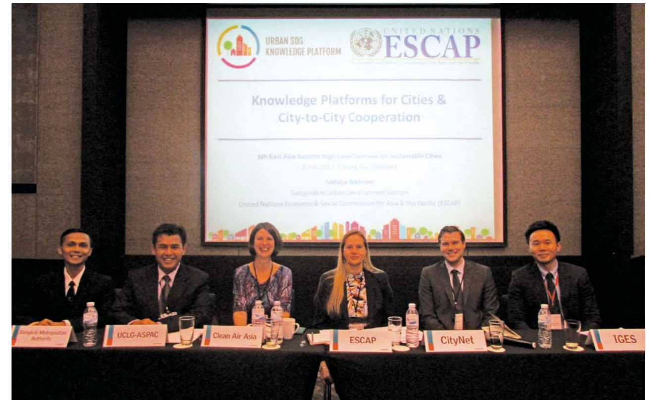
CityNet presents the session "Knowledge Platforms for Cities and City-to-City Cooperation" in the 8 th East Asia Summit High-level Seminar on Sustainable Cities organised by IGES.

CityNet presented the session "Knowledge Platforms for Cities and City-to-City Cooperation" in the 8 th East Asia Summit High-level Seminar on Sustainable Cities organised by the Institute for Global Environmental Strategies (IGES) on behalf of the Governments of Thailand, Japan, Cambodia, ASEAN Secretariat and ASEAN Working Group on Environmentally Sustainable Cities in Chiang Rai, Thailand, on 8-9 February 2017.