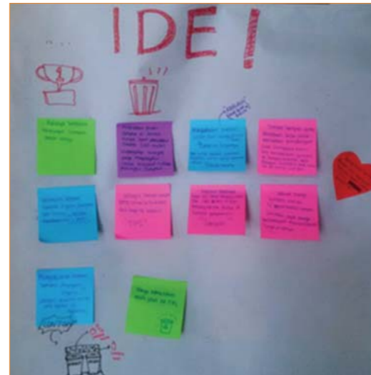
Different approaches of the Reframe phase