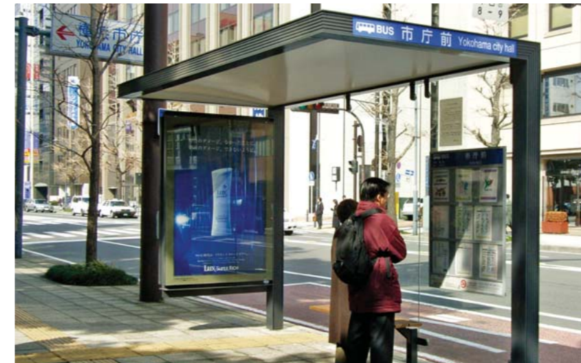
Bus Shelter Advertisement

Adopting the current trends, we would like to continue finding new themes and projects, which will be fundamental assets for the unique and vital urban development of Yokohama.