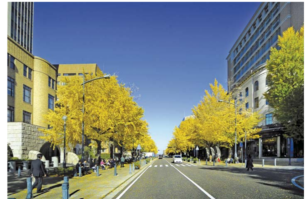
Nihon Odori Street