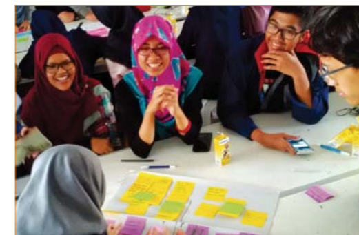
Different approaches of the Reframe phase