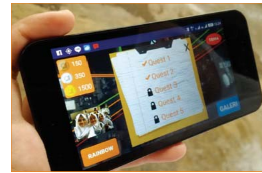
Participant uses the smartphone application in the field.

A group of participants from SMA 8 Bandung observed the area of Jalan Batu Kencana in Turangga. This neighborhood is a slum located at the border of inactive railroad tracks and owned by PT. Kereta Api Indonesia-PT. KAI (Indonesia's major operator of public railways). They found problems related to waste, such as bad waste/garbage management, an overflowing garbage dump, and river pollution caused by household waste and solid waste. They also found potential areas to develop, such as a waste bank for inorganic trash, organic waste used as compost material, and empty land that could be used as green open space.