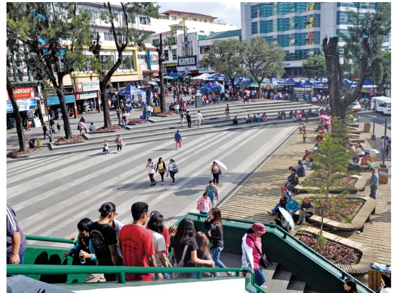
Malcolm Square serves as a people-friendly breathing room within a commercial and economic zone.