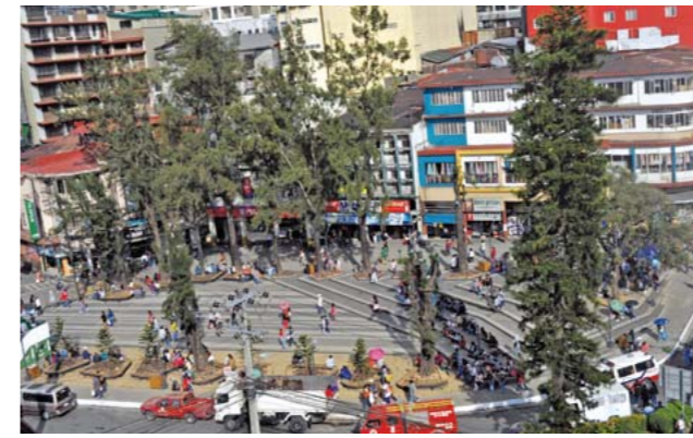
Malcolm Square is widely known as People’s Park.