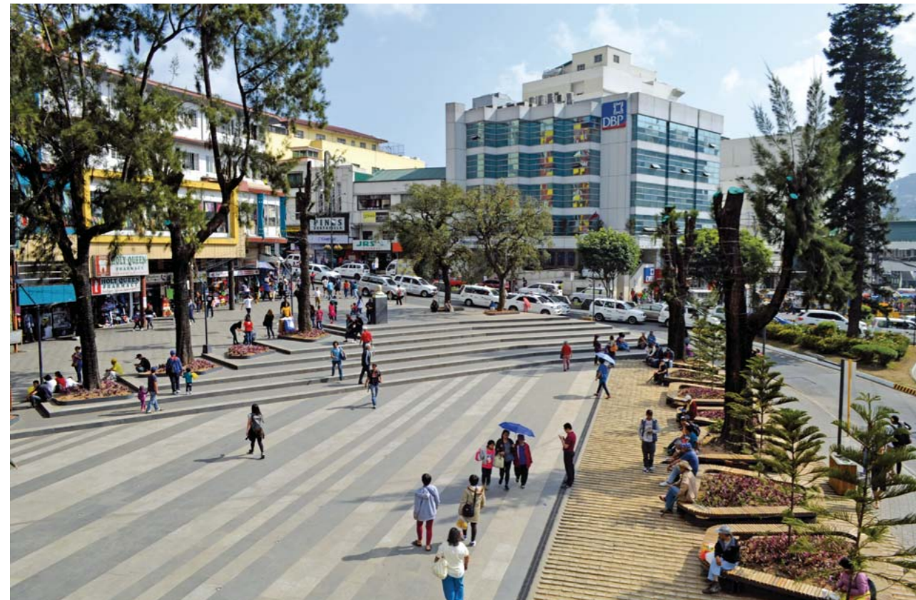
The Square is designed in a wedge shape with a gradual slope and a stepped surface

living environmentally and allow the buildings around it to flourish.