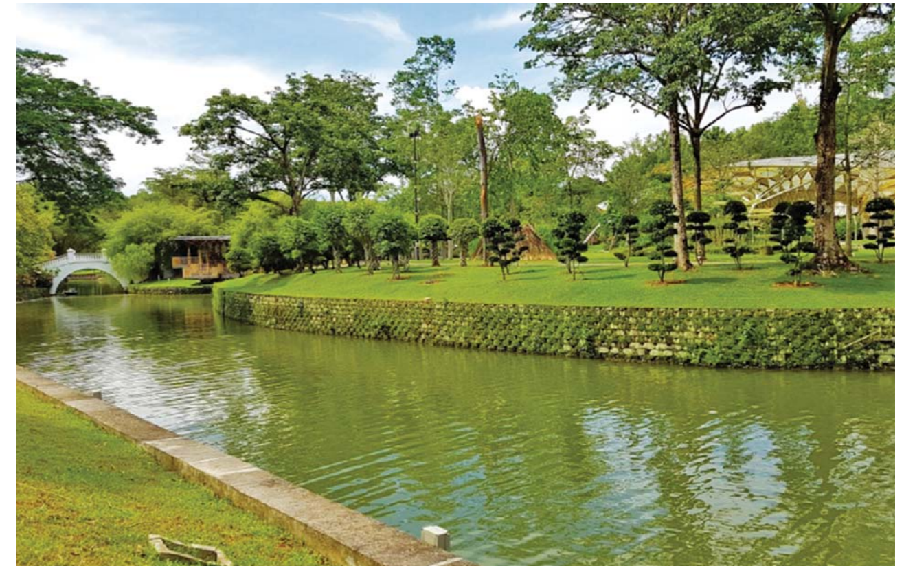
Green scenery of the garden