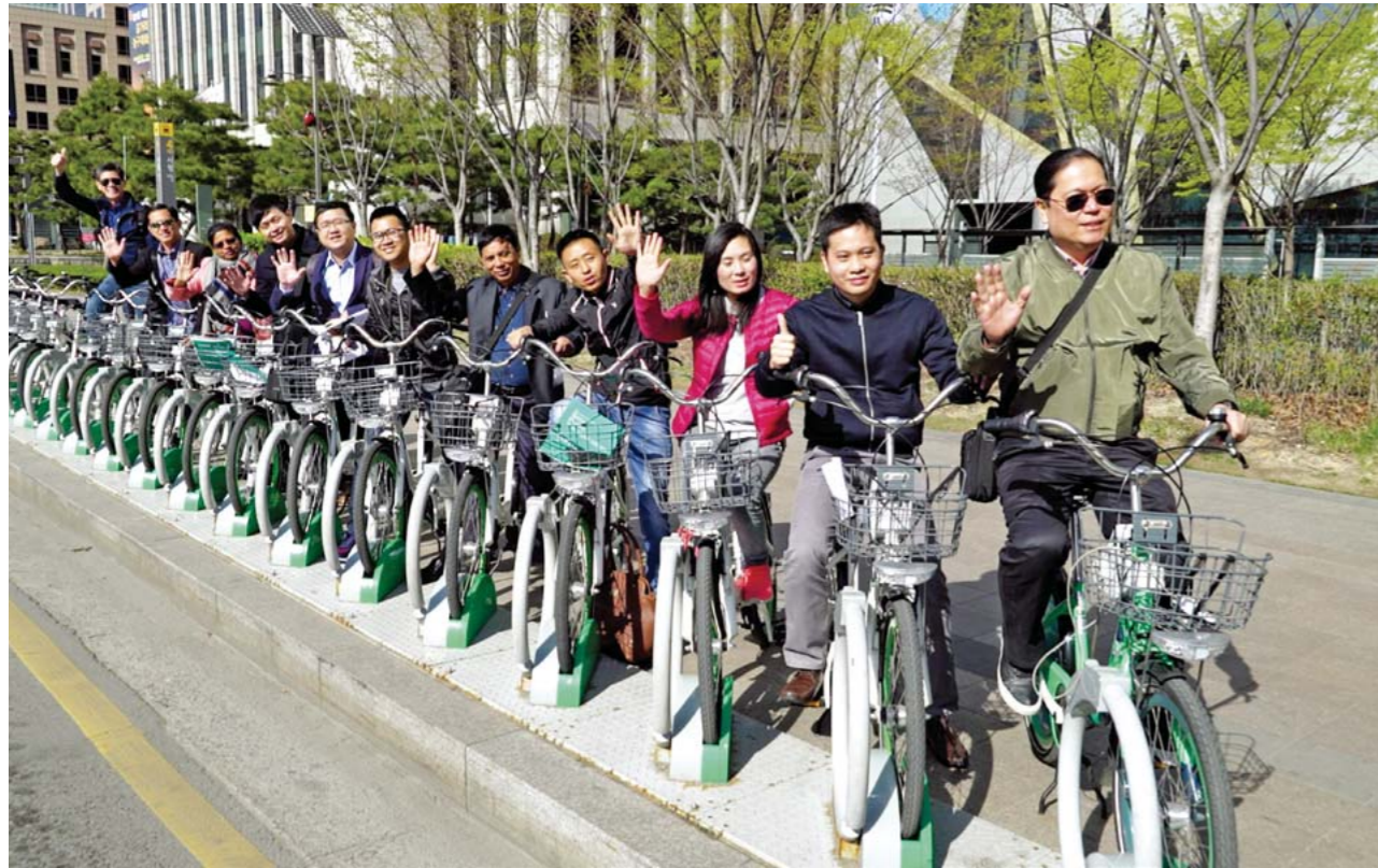
CityNet and SHRDC hold a workshop on the Transportation Strategy for Asian Cities on 9-15 April.

Following the success of last year's workshop on Transportation Strategy for Asian Cities, conducted in partnership with the Seoul Human Resource Development Center (SHRDC), CityNet organized a workshop underlining Bus Rapid Transit and Transfer System from 9-15 April 2017 in Seoul.