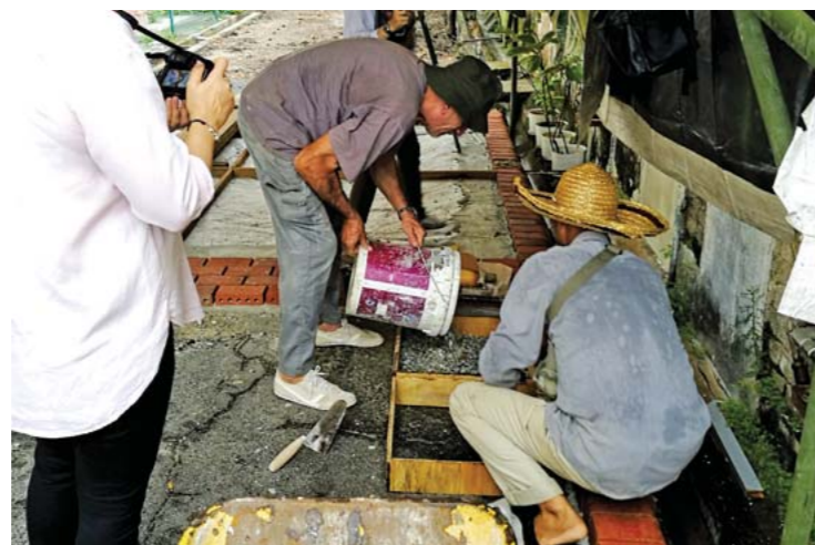
AKTC and Think City collaborate on the Armenian Park Backlanes project.

In the last 10 years, Bandung has grown rapidly and become part of an extended and complex metropolitan area, which has given rise to diverse and complicated problems. The presence of densely populated kampung kota (‘urban villages’ or slums) poses a variety of issues. Protected areas, such as riparian zones (riverbanks), are used for building houses. Unfortunately, such unregulated land use can lead to an unhealthy and unsafe environment.