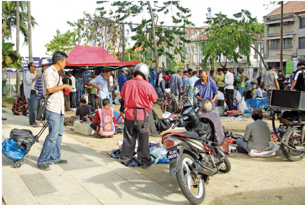
The site before the upgrading efforts

Think City's high note in 2016 was the opening of the open space at Armenian Street - a labour of love four years in the making. Since then, the park and the surrounding public facilities that were also upgraded, have played host to many families and individuals looking for some respite. However, the project almost never came to be. What were the challenges faced and how did Think City and its partners turn the project into a shining example of urban regeneration?