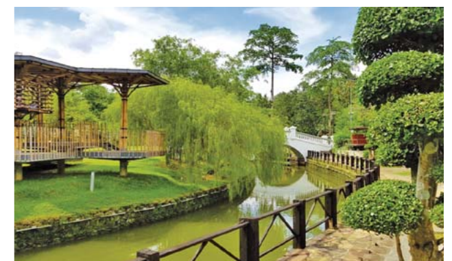
Visitors can rest and relax while enjoying the view of Perdana Botanical Garden.