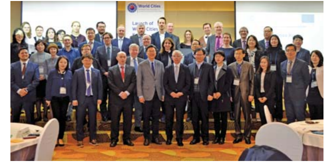
Four Korean cities are paired with four European cities as part of the World Cities project phase two to exchange best practices to promote urban policy in respective countries.

EU Ambassador Reiterer stated that "The European Union and Korea recognise that the development of cities is a key factor in the promotion of sustainable development in the world. The European Union is therefore committed to engaging with partners around the globe, to expand opportunities for city-to-city cooperation developing capacities and fostering exchanges of urban solutions and mutual learning to jointly address the challenges of sustainable development in our partner countries overall. The majority of our