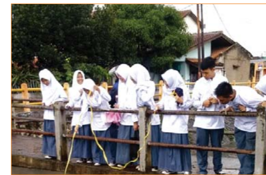
Water sampling for quality testing