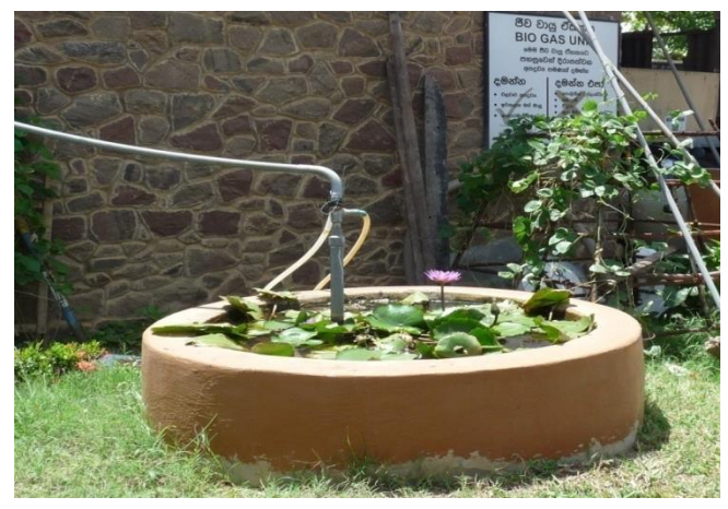
Galle Municipal Council