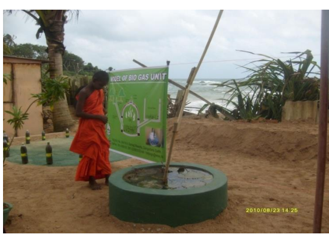
Galle International Buddhist Center