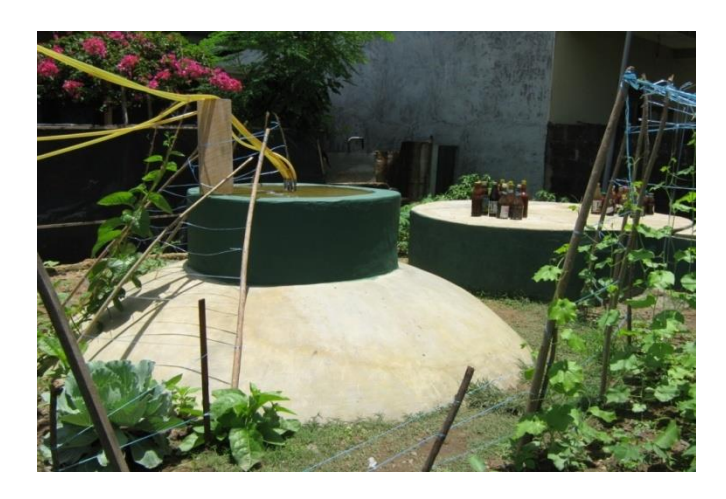
Galle Community Project