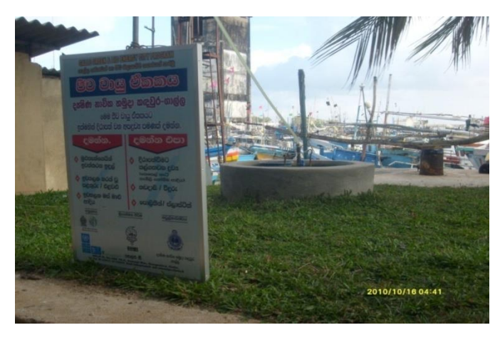
Galle Naval Base