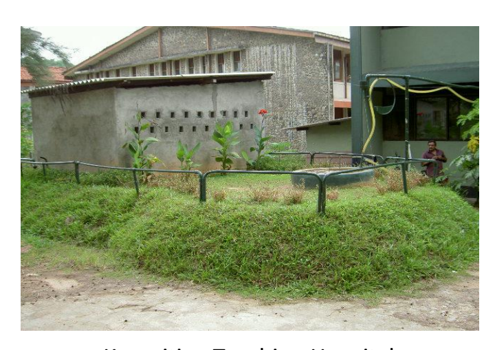
Karapitiya Teaching Hospital