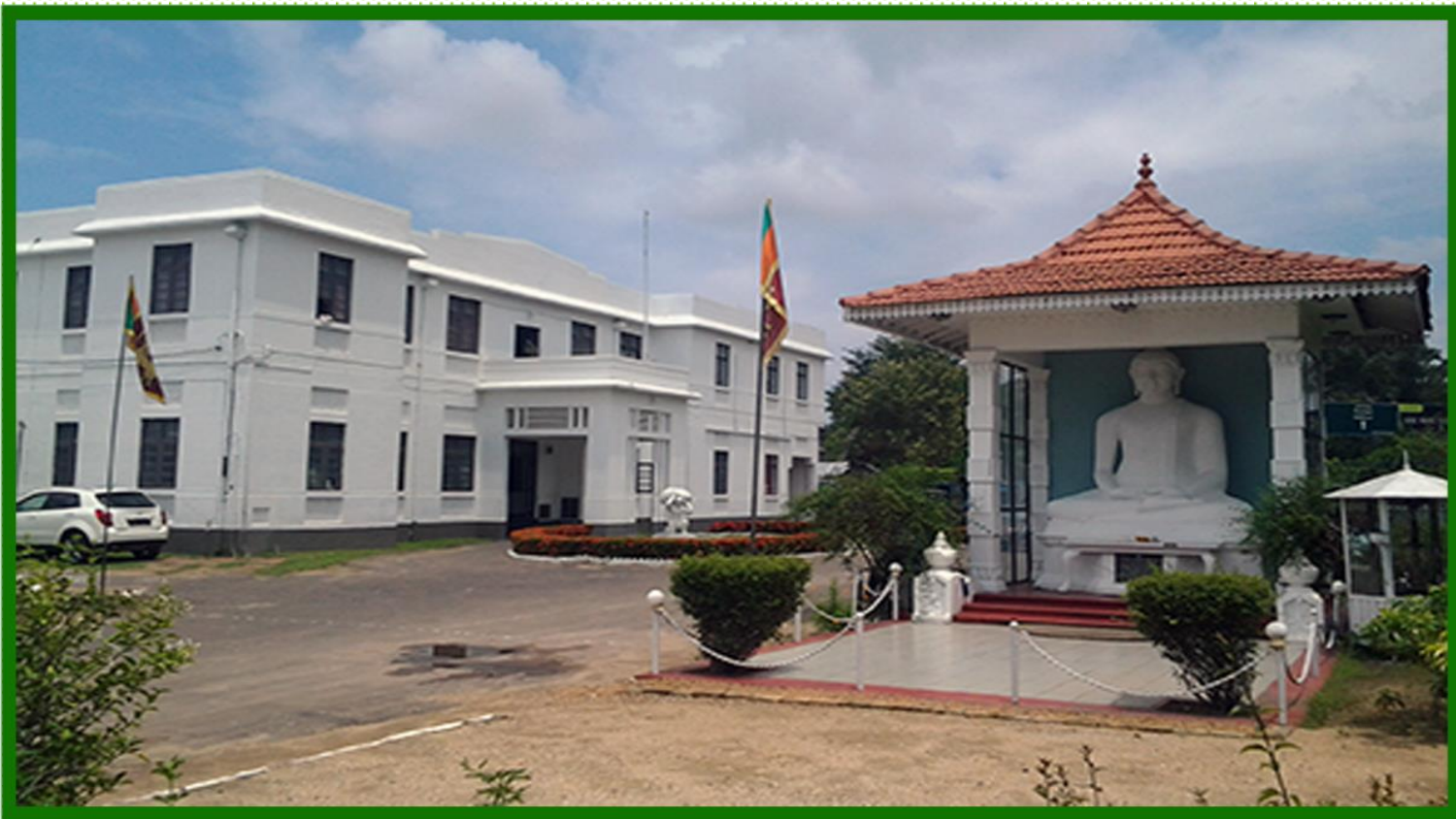
SRI JAYAWARDENAPURA KOTTE MUNICIPAL COUNCIL - SRI LANKA