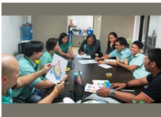
Exhibit Team Plans for DRR Information and Exhibit Center

The Jubilee Hall of Iloilo has been chosen to be the venue to host the first DRR Information and Exhibit Center in the Philippines. The Design Team Iloilo met seven times in March to discuss the content of the DRR Information and Exhibit Center